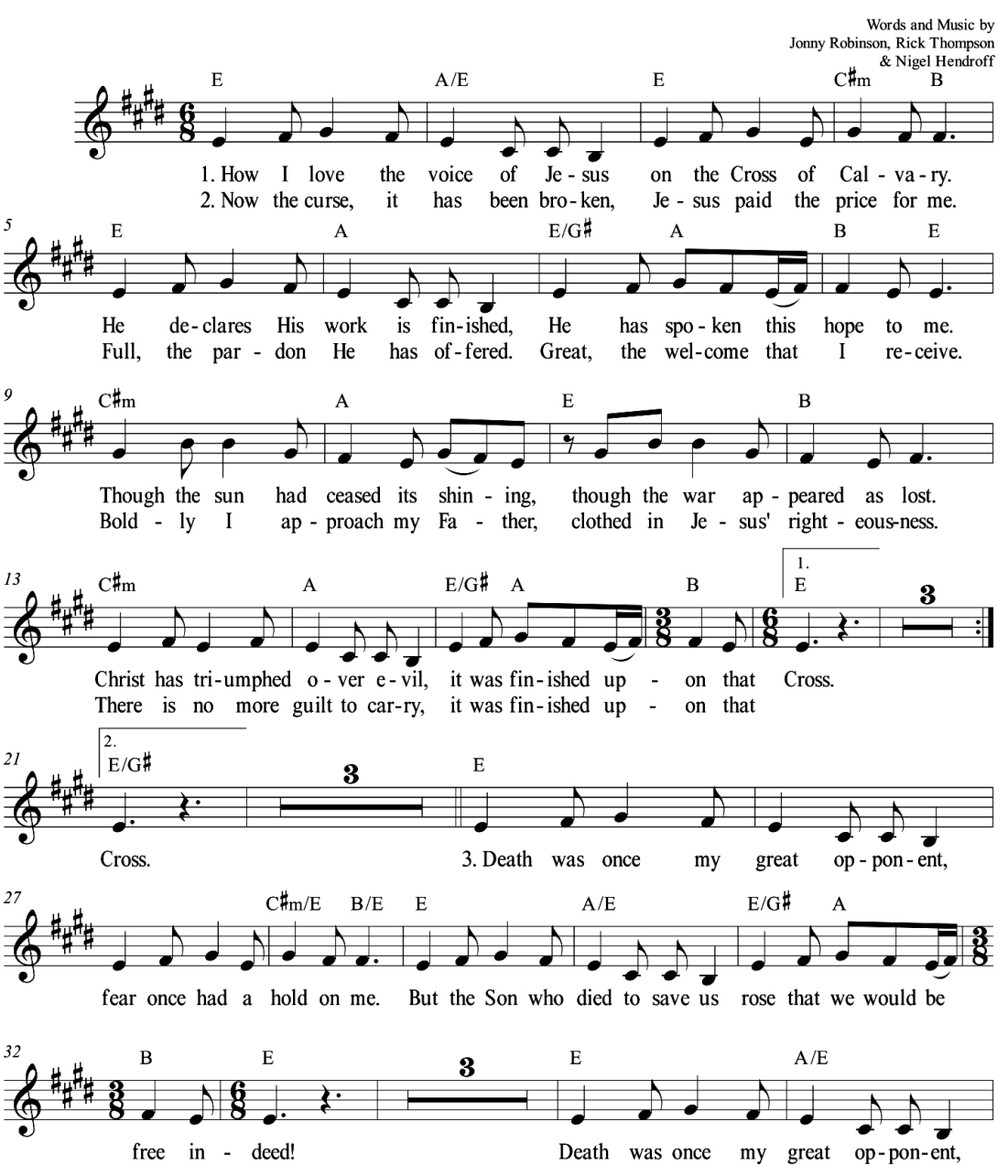
CCLI Song #7171907 © 2021 SHOUT! Music Publishing Australia | CityAlight Music CCLI License #162703