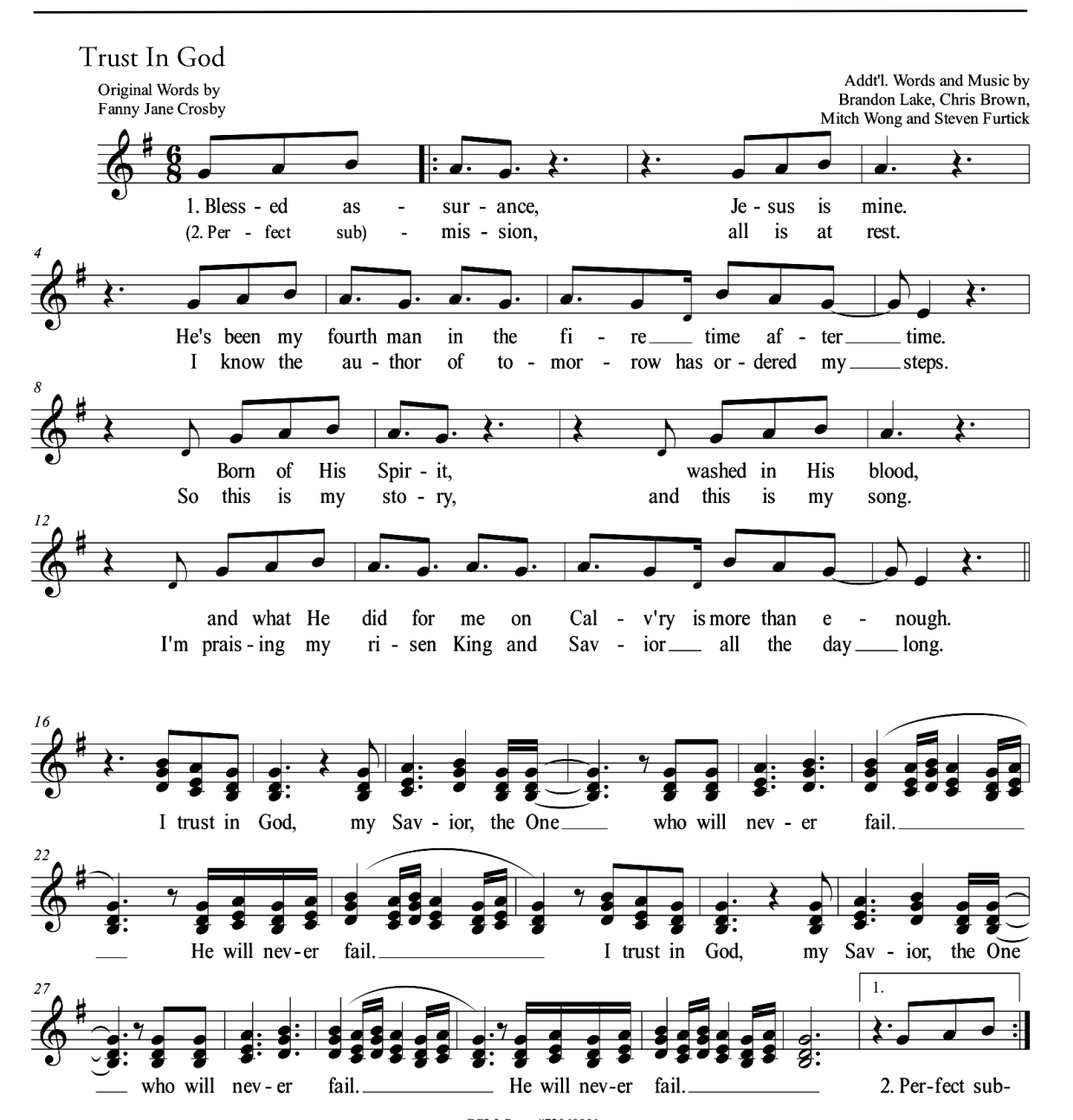
CCL1 Song #72060001 © Brandon Lake Music | Music by Elevation Worship Publishing A Wong Made Write Publishing | Integrity's Music CCLI License #162703